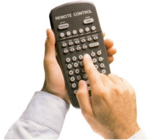
The Infrared ( IR ) Keyboard