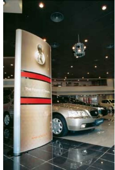
Designed to accept standard signage.